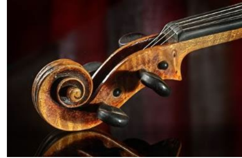
Violin-Scroll by Kreber

https://www.digitalphotomentor.com/photography-challenge-image-represent-song/#:~:text=The%20first%20thing%20you%20need,have%20a%20connection%20to%20it. https://www.musicstreet.co.uk/blogs/blog-post/exploring-how-musicians-inspire-and-influence-artists https://www.swedishimage.com/blog/blogs-about-photography/the-influence-of-music-on-fine-art-photography https://www.theguardian.com/music/2023/jul/21/new-labour-1997-rave-culture-ed-gillett-book-extract https://independent-photo.com/news/photography-and-music/#:~:text=Though%20music%20and%20photographs%20exist,expressive%20and%20more%20journalistic%20ways. https://fstoppers.com/opinion/how-music-can-impact-our-photography-602468 https://www.arthistorykids.com/blog/247 (The Muse of Music: Famous Artists Inspired by Sound) https://www.theguardian.com/artanddesign/2006/jun/24/art.art (Kandinsky) https://medium.com/@bonkerscorner/fashion-and-music-the-impact-of-artists-and-genres-on-fashion-trends-91a72c3a86b7#:~:text=Subcultures%20rooted%20in%20music%20have,%2C%20and%20cyberpunk%2D%20inspired%20fashion.