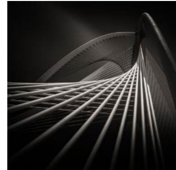
Swee C Oh, Seri Wawasan Bridge, Malaysia